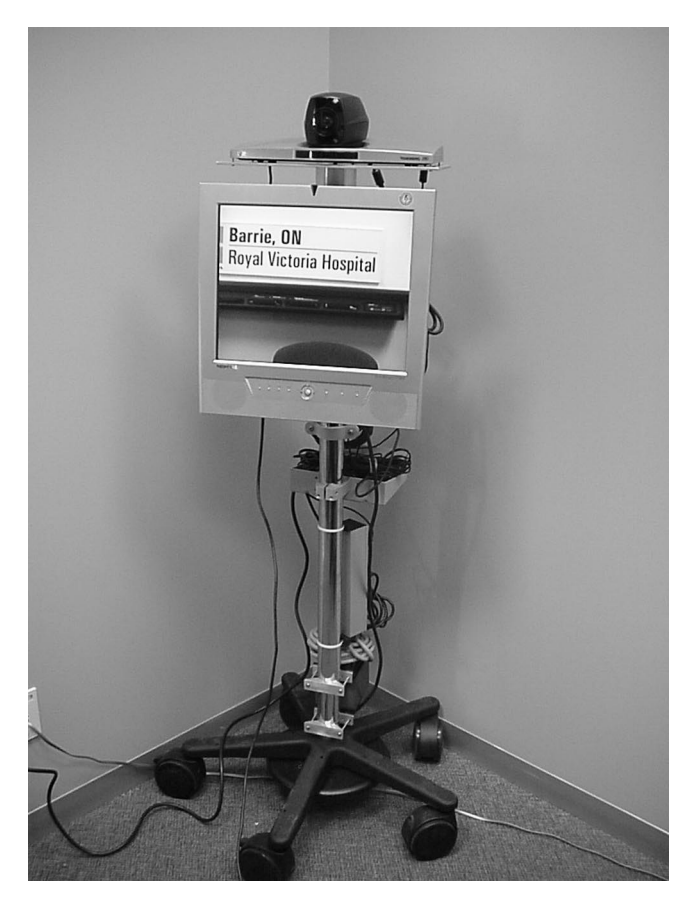
Fig. 1. Portable telemedicine unit with the viewing monitor and camera mounted on the unit.